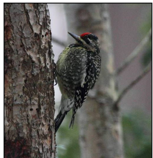
Yellow-bellied Sapsucker – EBNP WBC 2021