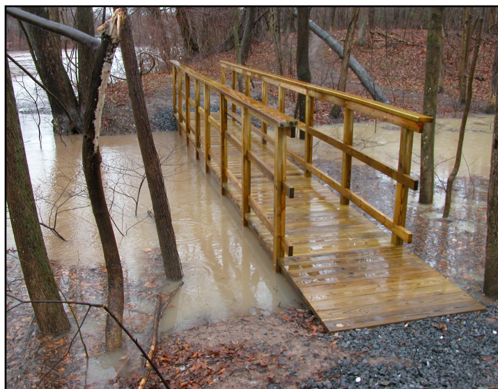
Why EBNP Needed Bridges - Really Strong Ones!