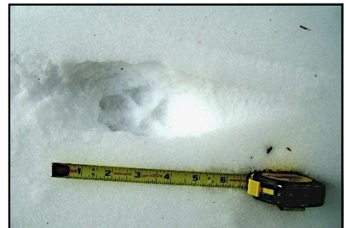
Coyote Paw Print

So, as you enter the Esopus Bend Nature Preserve these days, don't be surprised if you get the feeling that you are returning from a long trip down the evolutionary highway, to a familiar place, a place that harkens back to the childhood of your existence.