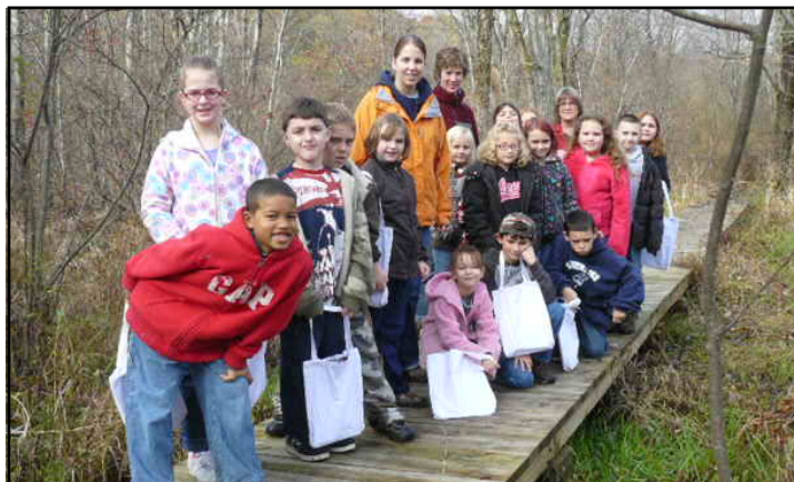
Mt. Marion 3rd Grade Class On Wetlands Boardwalk

ECC welcomes this opportunity to join the