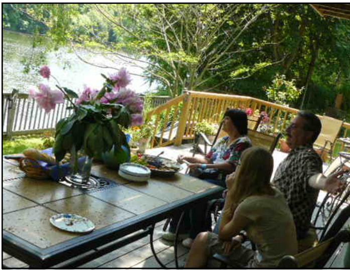
Life Is Sweet on the Creek

Decks and Docks on the Esopus is definitely a most unusual and delightful event! It's a safari trip by canoe, kayak or rowboat on the Esopus Creek in Saugerties with stops at some beautiful secluded decks, docks, lawns and patios of creek residents.