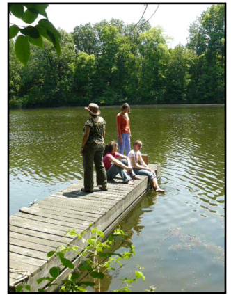
Dock of the Bay?