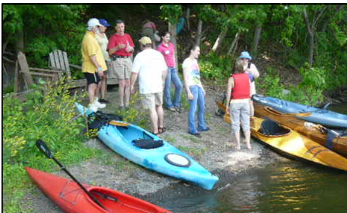
This Must Be the Place

Last June, on a perfect sunny day the tour opened a whole new world for me. At each stop welcoming and hospitable homeowners encouraged us to relax and enjoy their beautiful views and delicious refreshments. If you aren't fortunate enough to have your own waterfront